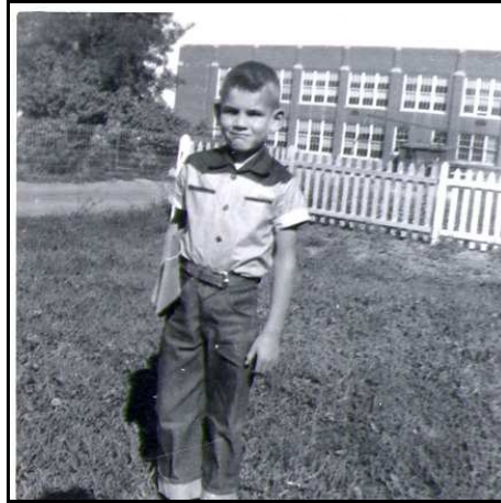
The little boy in the story

My father was in construction and worked very hard to provide for us, he and mom were good parents who loved us deeply, providing for our physical care but our church life was nonexistent. I never remembered going to church with them ex-